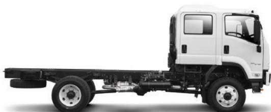
FTS 139-260 4x4 Crew