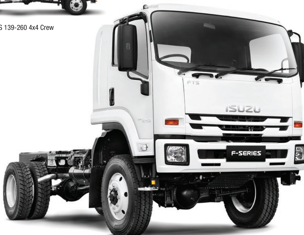
FTS 139-260 4x4